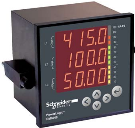
DM6000 series digital panel meter front display (above), and rear (below)