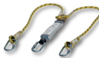
Twin-Leg, kernmantel rope, steel screwgate carabiners