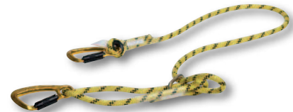
Kernmantel Rope, Aluminium Carabiner