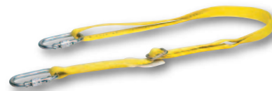
Webbing, Steel Screwgate Carabiner