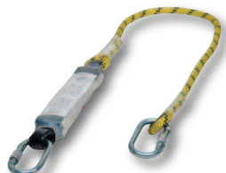
Single-Leg, kernmantel rope, steel screwgate carabiners