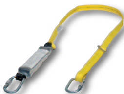
Single-Leg, webbing, steel screwgate carabiners