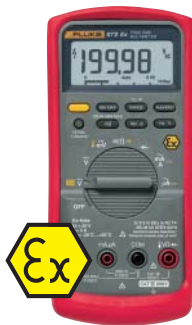
Fluke 87V Ex